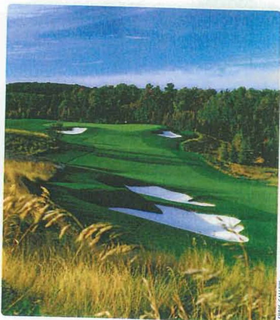
BELOW: Tom Fazio's Coppinwood is one of Canada's more celebrated modern designs, with its 12th hole the central part of a phenomenal three-hole stretch.

have to scroll down to No. 24 (Bigwin Island) to find the 15th best post-1960 design; you've got to go to No. 50 (Calgary G&CC) to find the 15th best classic design. That's likely a reflection of the golf course construction boom of the 1990s, a surge that most certainly has come to an end. So modern day architecture reigns supreme in terms of quantity, while classic courses have the edge when it comes to quality. The question for you is: which 'Q' word is more important?